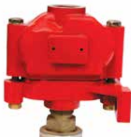
DUPLEX CHECK VALVE